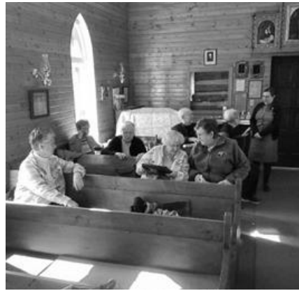
Pictures from the Road Trip May 4, 2024 The first 2 at St Aidan and St Hilda at Rexboro The second 2 at the Catholic parish of Ste Anne at Lac Ste Anne and the Pilgrimage grounds